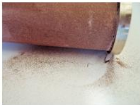
Step 1 – A dirty filter element

An ultrasonic clean can increase the life of your filter and save you money!