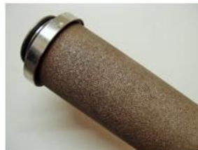
Step 3 – A clean element

For more information on our filter range or any of our products and services head to our website